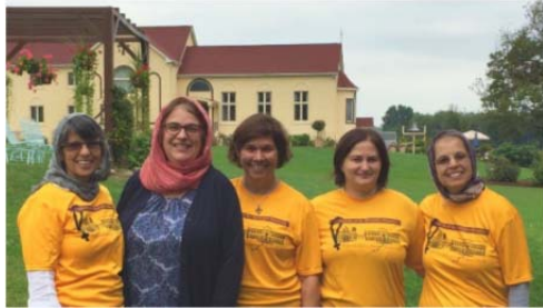
Presvyteres at Saxonburg Monastery