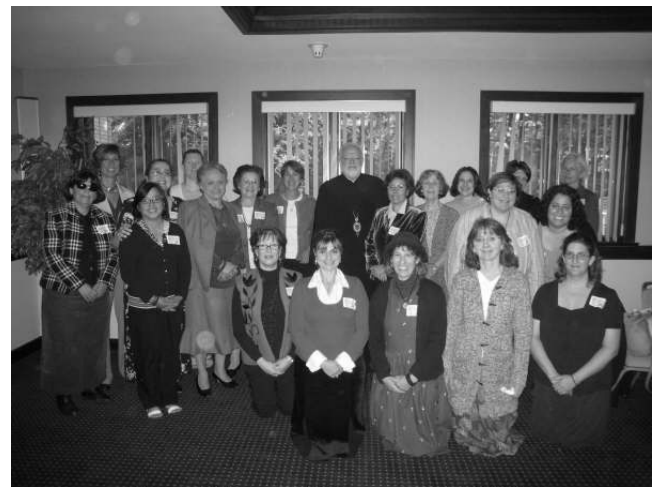
Boston Sisterhood of Presvyteres Fall gathering participants.